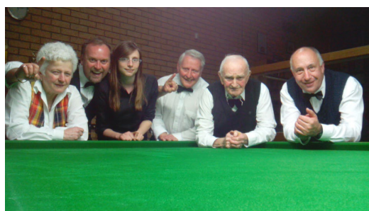
STBSA B Grade Premiers - RSL Bunnies

Last year the Claremont RSL Club won both the Division 1 & Division 2 STEBA 8 Ball Premierships as well they won both STBSA A Grade & B Grade Snooker Premierships.