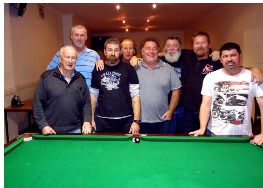
STEBA Div 2 Premiers - RSL Devils