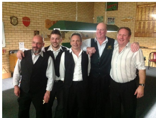
STBSA A Grade Premiers - RSL Muppets