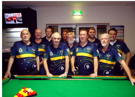
STEBA Div 1 Premiers - RSL Scorpions

TASMANIAN ENGINE RECONDITIONING SERVICES